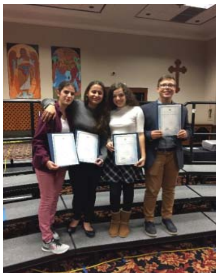
Congratulations to the students who received the Certificate of Attainment in the Greek Language.