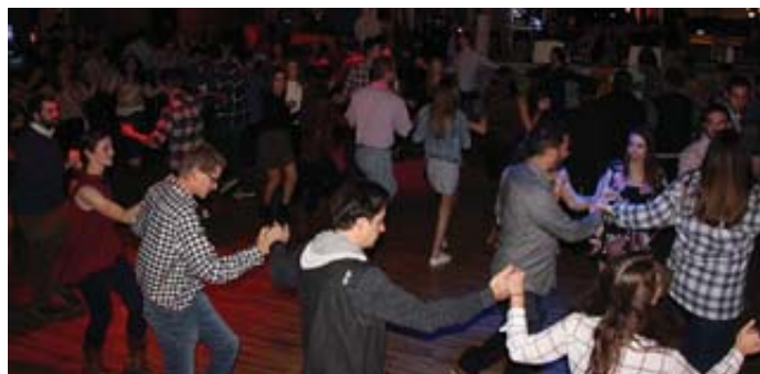
Greek Dancing, YAL Conference, Houston, Texas