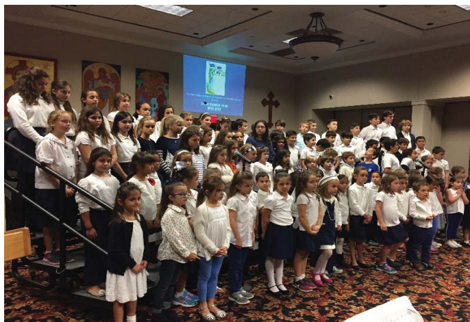
The students singing the national anthems.