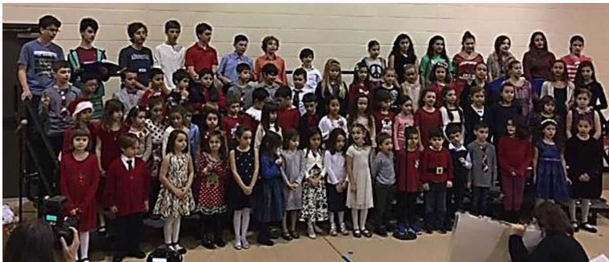
Annunciation Greek Language & Culture School Students, Christmas Program December 2016