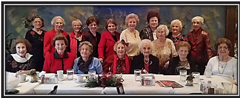
Kali Parea Christmas Luncheon December 2016 .