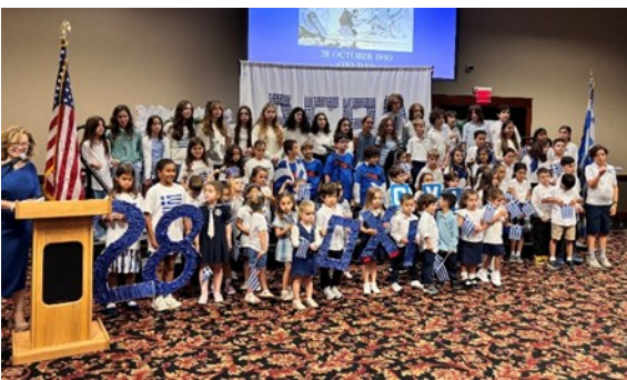
Our students sing the national anthems