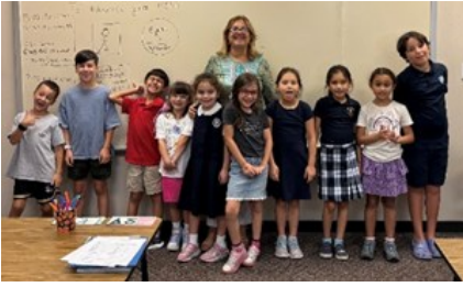
2 nd Grade – Η τάξη της κυρίας