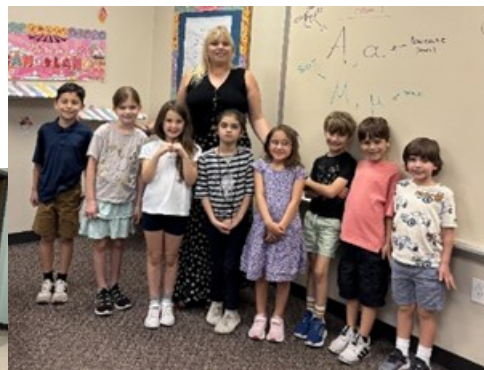
1 st Grade – Η τάξη της κυρίας Έφης