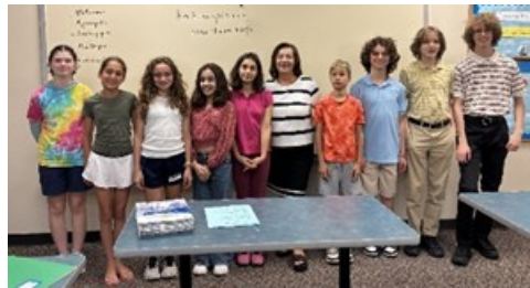
6 th Grade – Η τάξη της κυρίας Καλής