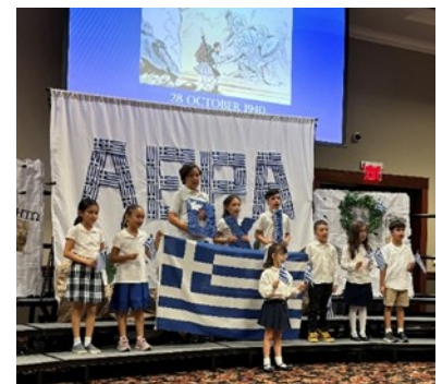
2 nd grade students recite their poem