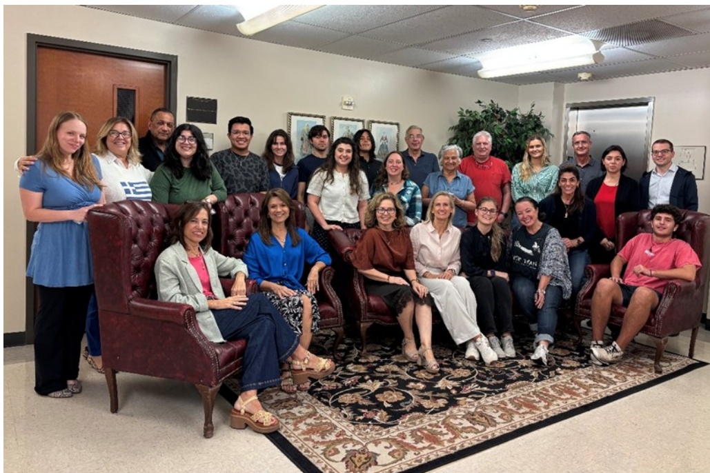
Adults Program – Beginners I, Beginners II, Intermediate, Advanced Our adult students with their teachers:

We are also very proud of our adult program. We offer Modern Greek Language classes for all levels: Beginner, Intermediate, and Advanced. The classes take place in person every Tuesday at 6:30pm. We encourage everyone to attend our classes and see how exciting it is to learn the Greek language. The spring semester starts on Tuesday, February 3, 2026.