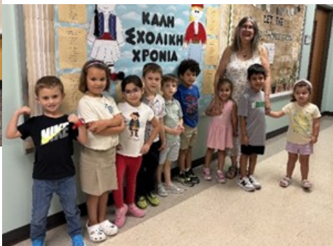
Kindergarten – Η τάξη της κυρίας Πόπης