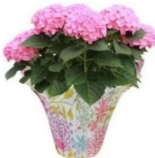
Pink Hydrangeas 8"