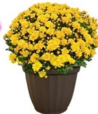
Yellow Mum 6"

SUPPORT THE MAIDS OF ATHENA WITH THEIR SPRING FLORAL FUNDRAISER!