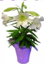
Easter Lilies 6" and 9"